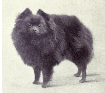
A MINIATURE POMERANIAN FROM 1915

POMERANIANS ARE A SPIRITED TOY DOG WITH A BOLD PERSONALITY WITH THEIR FULL FLUFFY COATS, THEIR ALWAYS SMILING BRIGHT AND CHEERFUL. YOU MAY WONDER WHAT THESE LITTLE DOGS WERE ACTUALLY BRED TO DO. POMERANIANS HAVE QUITE A REMARKABLE HISTORY BEHIND THEM THAT INCLUDES ROYALTY AND A TRIP ON THE TITANIC.